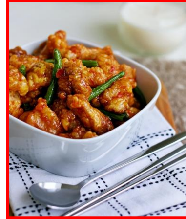
Sweet Thai Chili Chicken