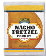
Nacho Pretzel Pocket