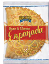
Bean & Cheese Empanada