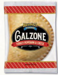
Turkey Pepperoni & Cheese Calzone