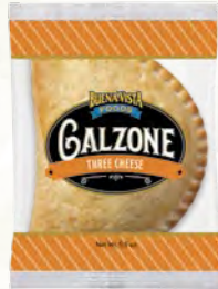
Three Cheese Calzone