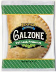
Spinach and Cheese Calzone

Tip: Make your budget go farther by utilizing your commodity dollars towards proteins for savory lunch entrées. Check out our commodity calculator at bvfoods.com